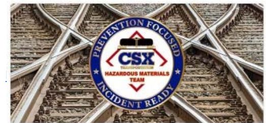
CSX Transportation - Emergency Response to Railroad Incidents (ERRI)

PRIOR TO THIS CLASS PLEASE ENSURE PERSONNEL TAKE THE CSX "EMERGENCY RESPONSE TO RAILROAD INCIDENTS TRAINING" at https://www.transcaer.com