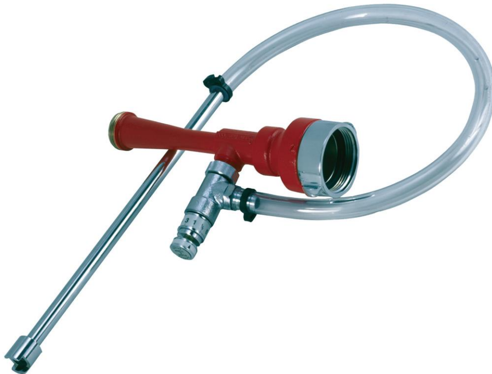
Figure 6.1: In-Line Eductor