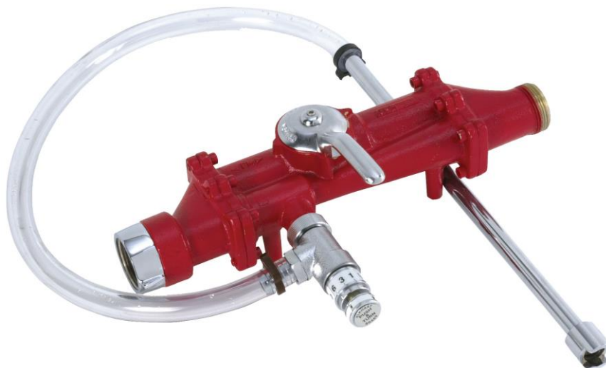
Figure 6.3: Bypass Eductor

Bypass eductors (see Figures 6.3 and 6.4 in the Participant Guide) differ in that they have a ball valve to divert flow from foam to just water, allowing time for cooling without wasting foam and with less flow restriction.