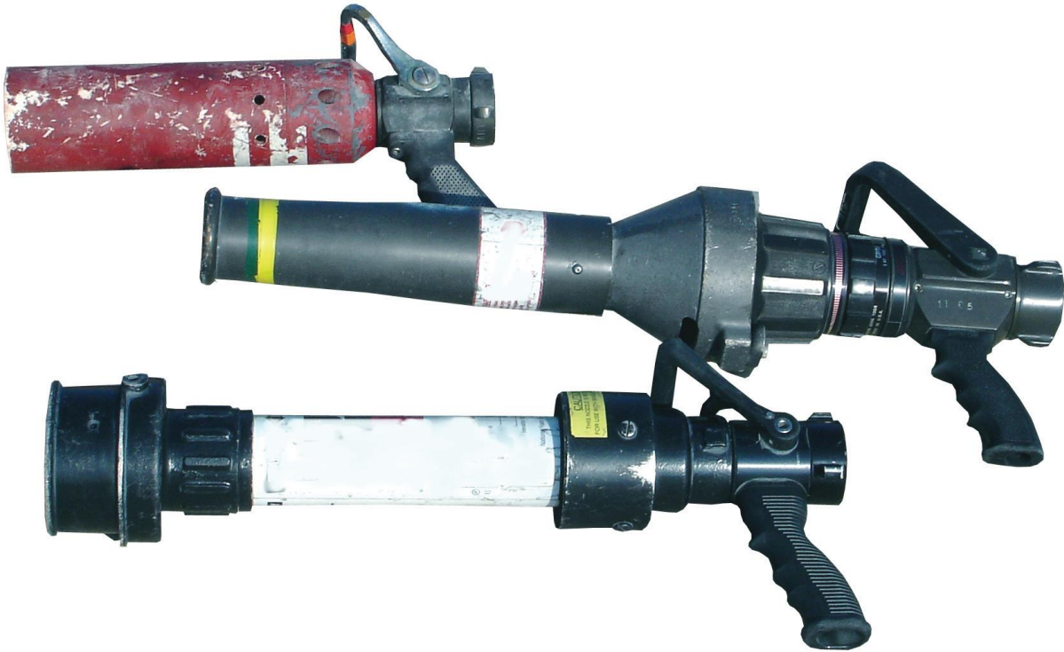
Figure 6.6: Air Aspirating Nozzles