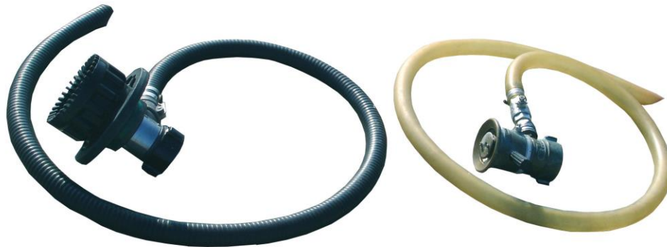
Figure 6.5: Foam Proportioning Nozzles with Air-Aspirator

Advantages of foam proportioning nozzles include: