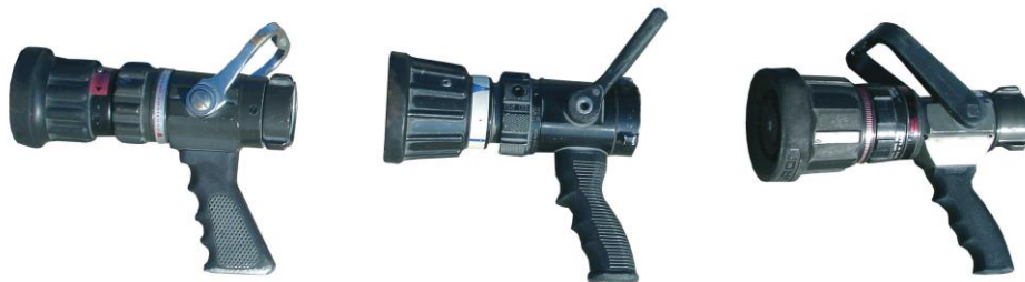
Figure 6.7: Non-Air Aspirating Nozzles

A disadvantage of aspirating and non-air aspirating nozzles is that you must have additional equipment in order to generate foam. In addition, the gallonage setting on the nozzle must match the set flow for the eductor. It is important to understand the benefits of both types of nozzles in order to select the most appropriate one.