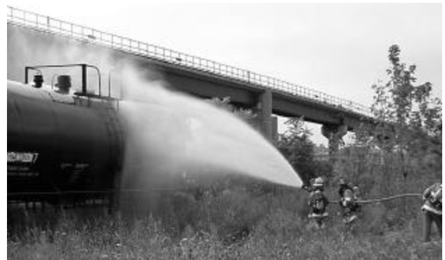
Firefighters responding to the incident.

The incident simulated the concurrent derailment of a CSXT freight train transporting hazardous materials, a MARC train with two passenger cars, and a Metrorail train.