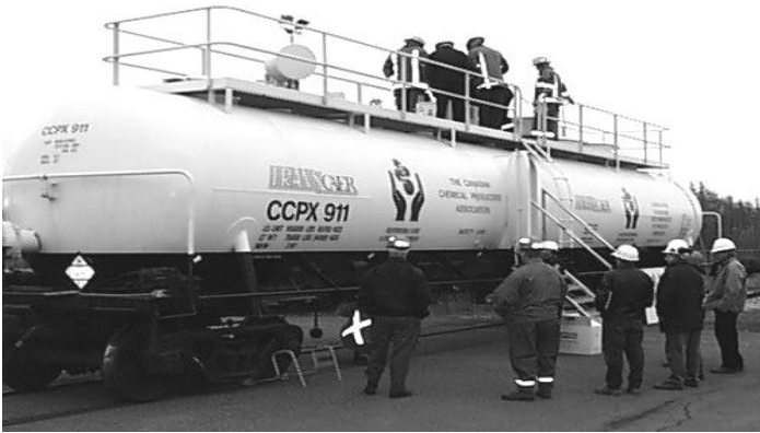
The Safety Train is one of the most practical and visible CCPA resources.

Quebec The regional committee established the “Safe Corridors” initiative that manages road