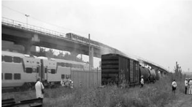
"Common Corridor 2000" exercise site.

On September 24, 2000, a full-scale emergency exercise involving CSX Transportation (CSXT), Amtrak, MARC and Metrorail was held in Washington, D.C. (MARC is the Maryland Rail Commuter service and Metrorail is the region's subway system.) The exercise entitled "Common Corridor 2000" trained and tested emergency responders from Washington, D.C. and other surrounding jurisdictions.