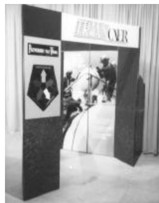
Full size booth