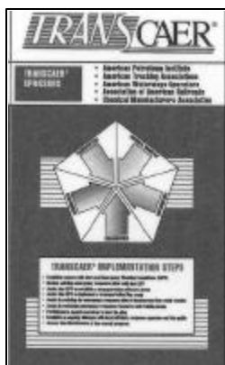
Center of table-top booth

Use one of the TRANSCAER ® booths at your next event. There are two types of booths available, table-top and full size, and both are FREE (excluding shipping charges)!!!