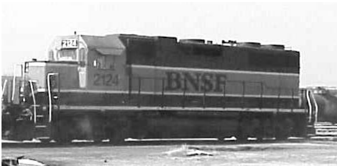
BNSF Safety Train Locomotive